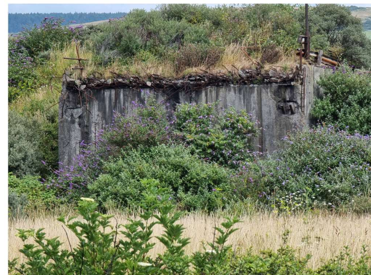
Photo 5 - Concrete Abutments