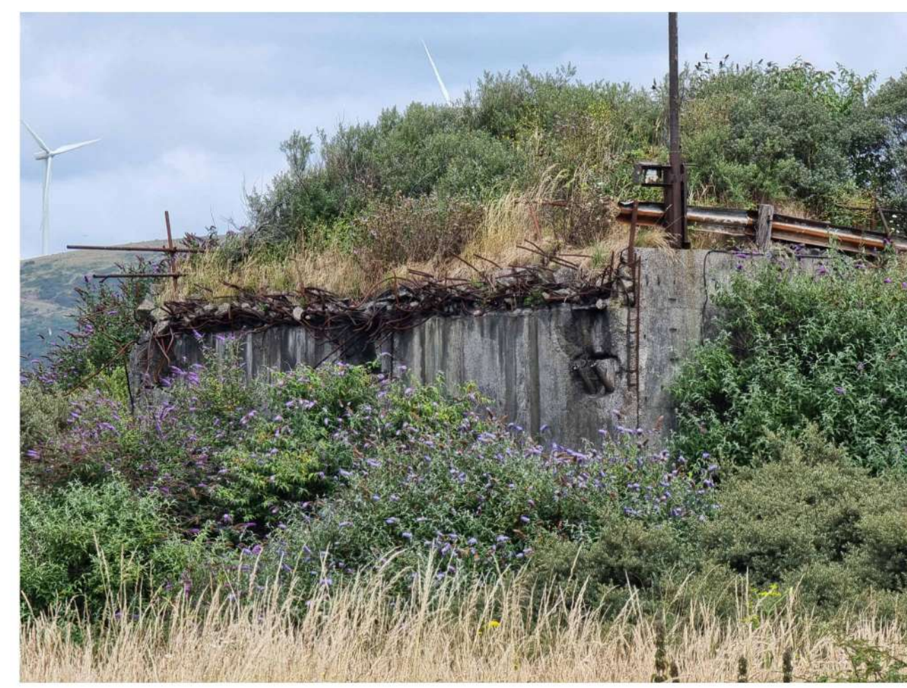
Photo 1 - Concrete Abutments