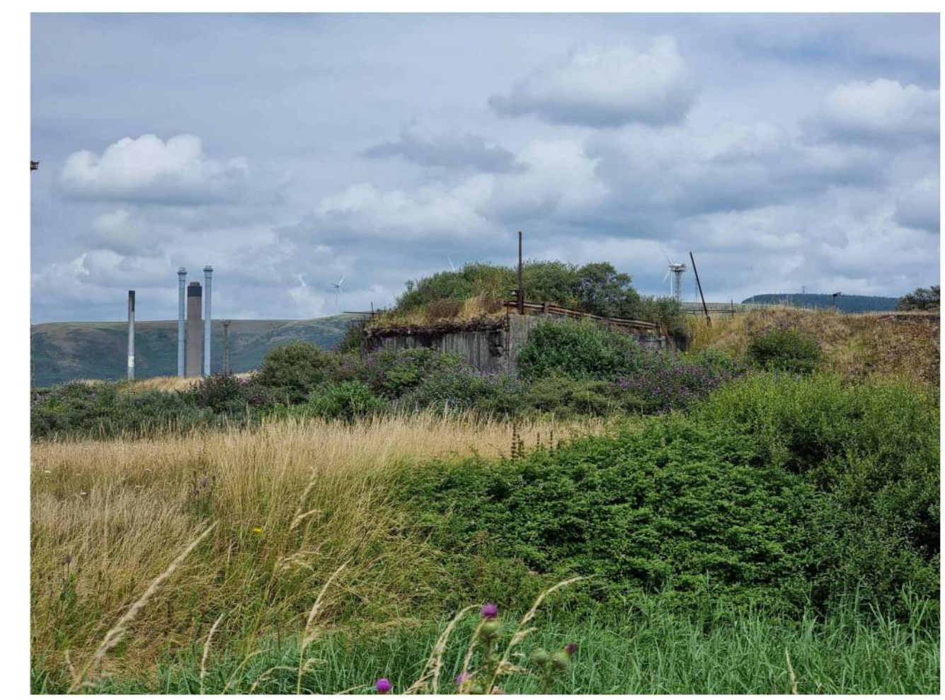
Photo 2 - Concrete Abutments