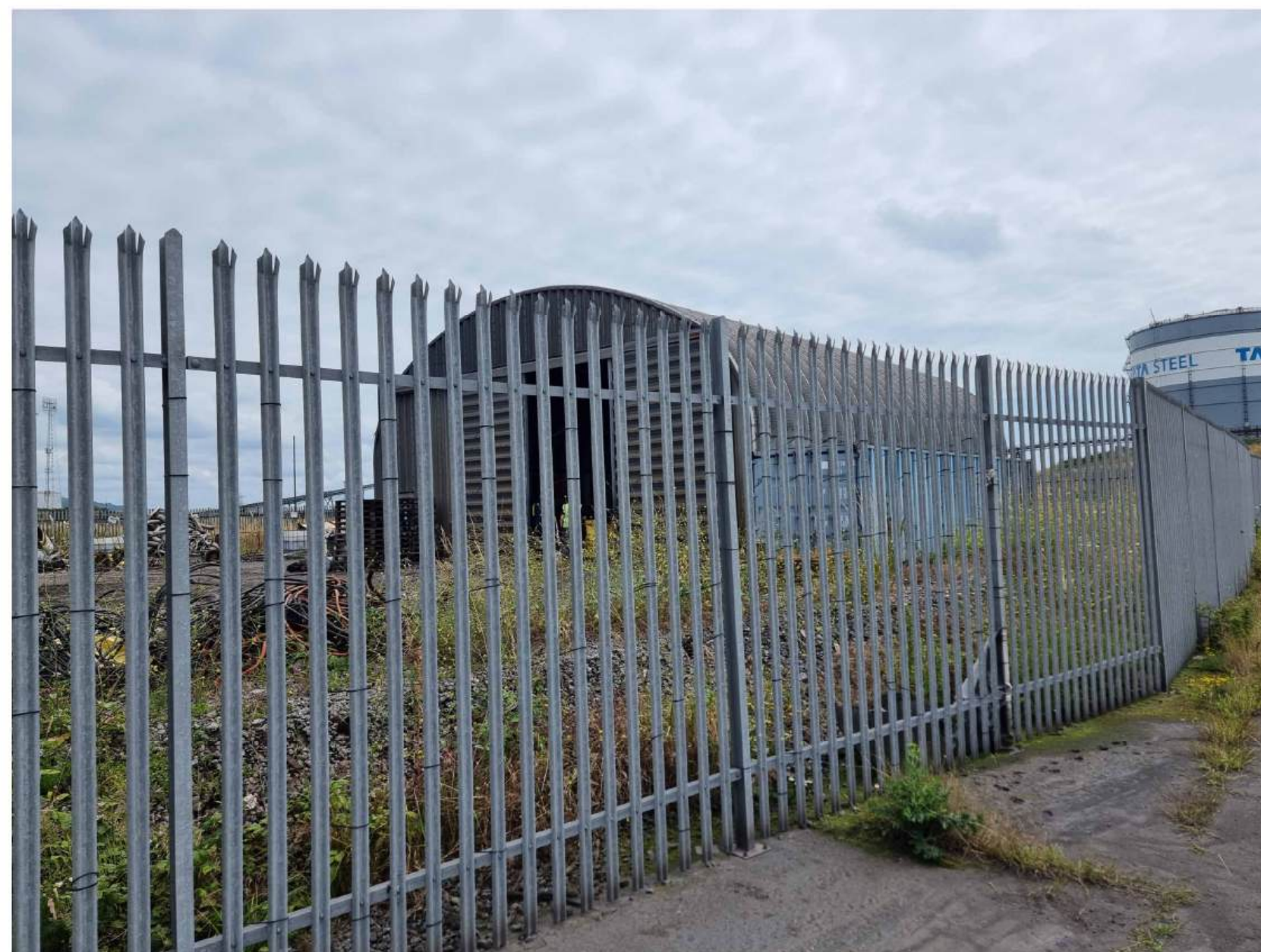
Photo 1 - Storage Shed