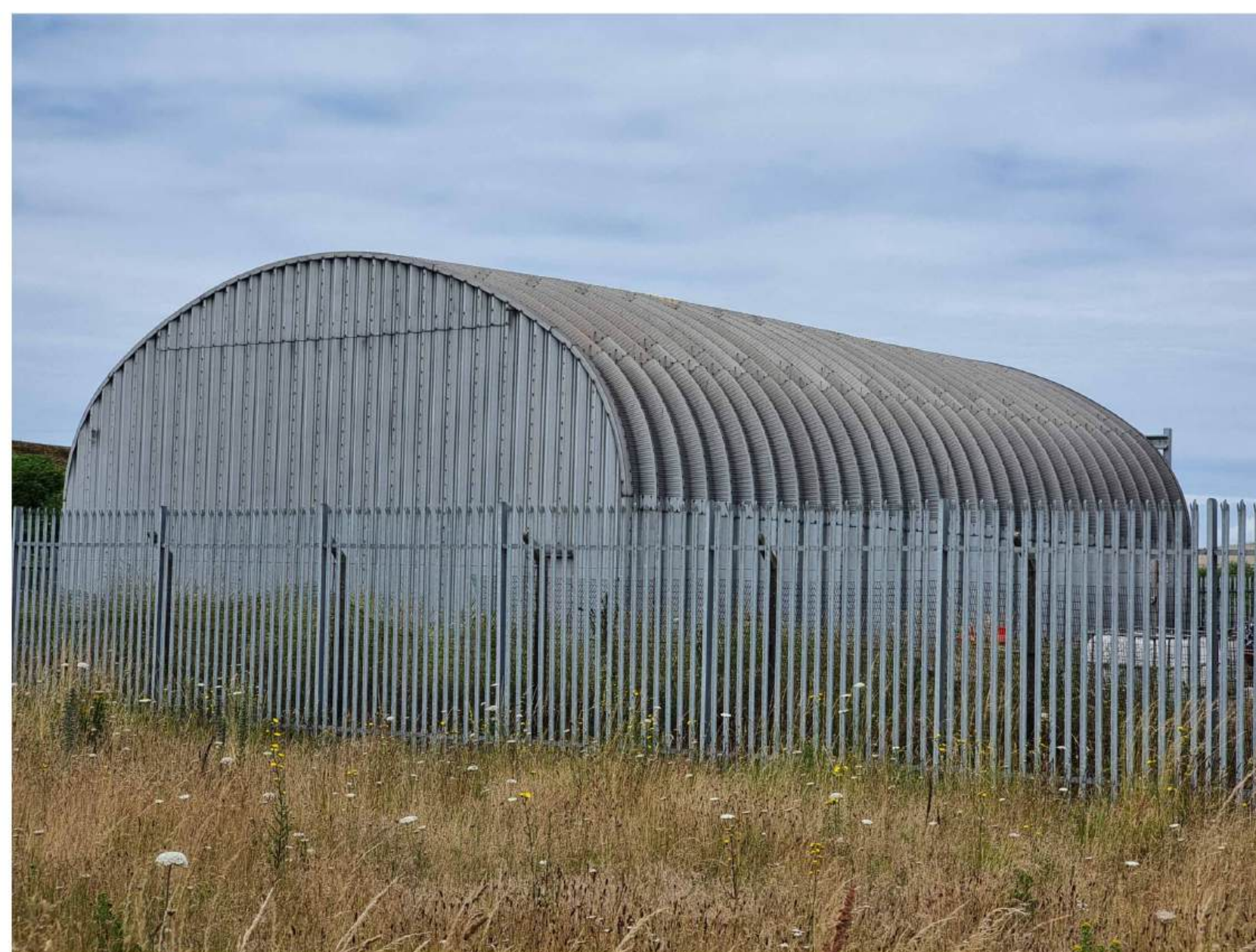
Photo 2 - Storage Shed