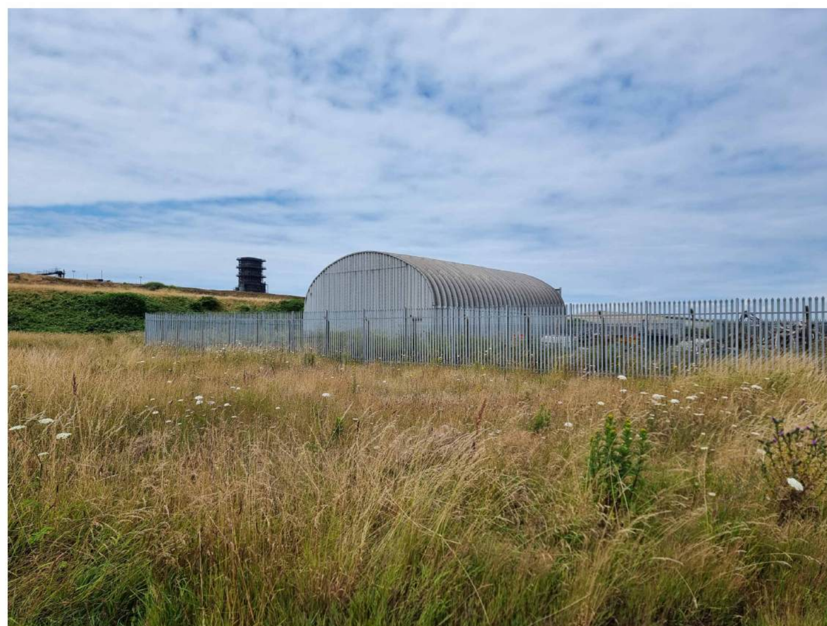
Photo 3 - Storage Shed