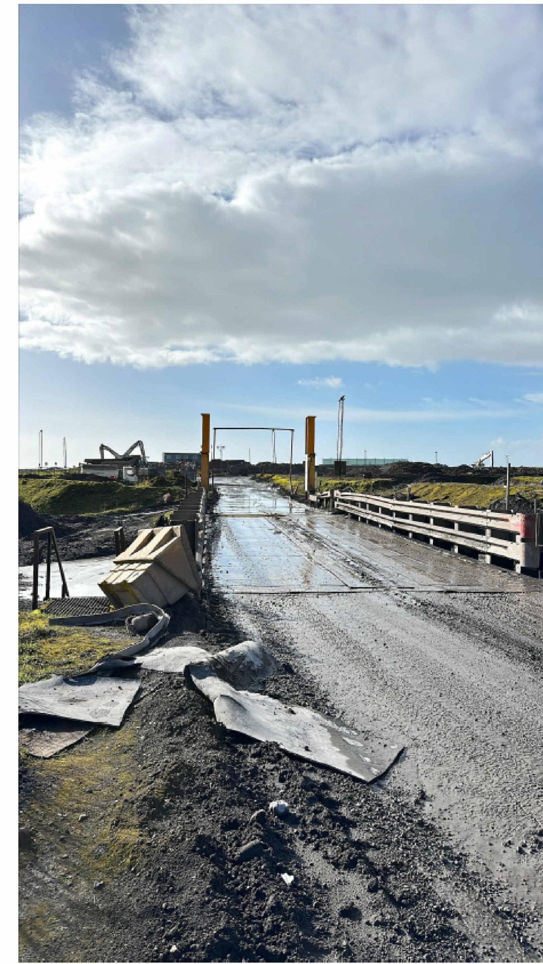
Photo 2 - Weigh Bridge