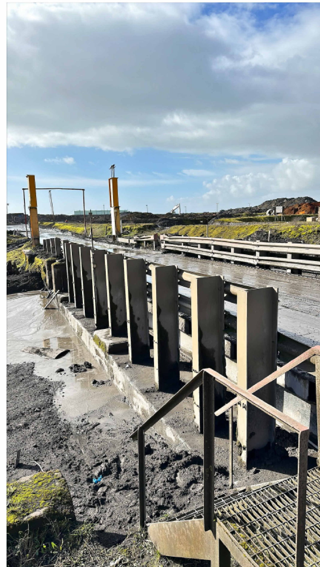
Photo 3 - Weigh Bridge