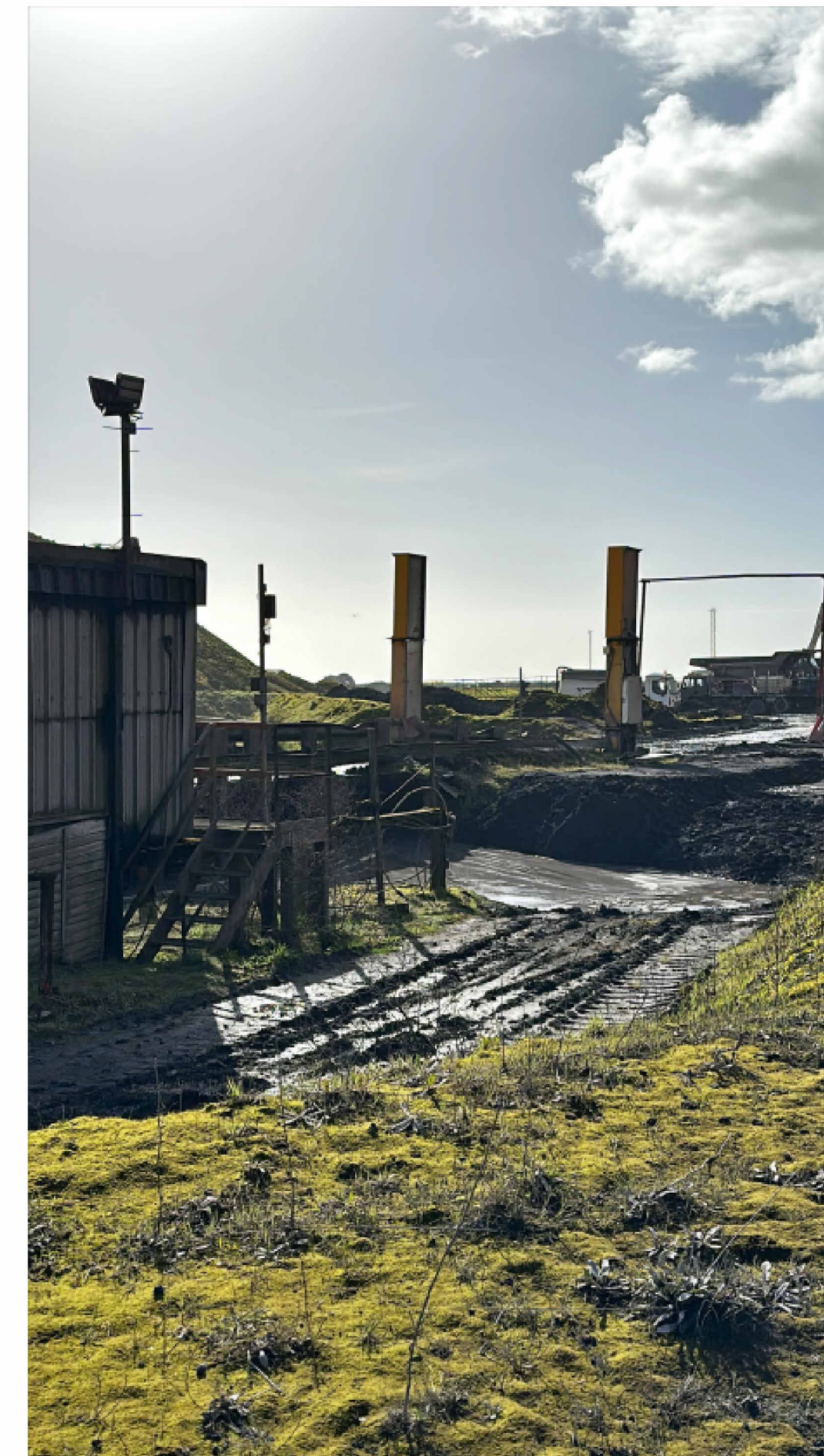
Photo 4 - Weigh Bridge