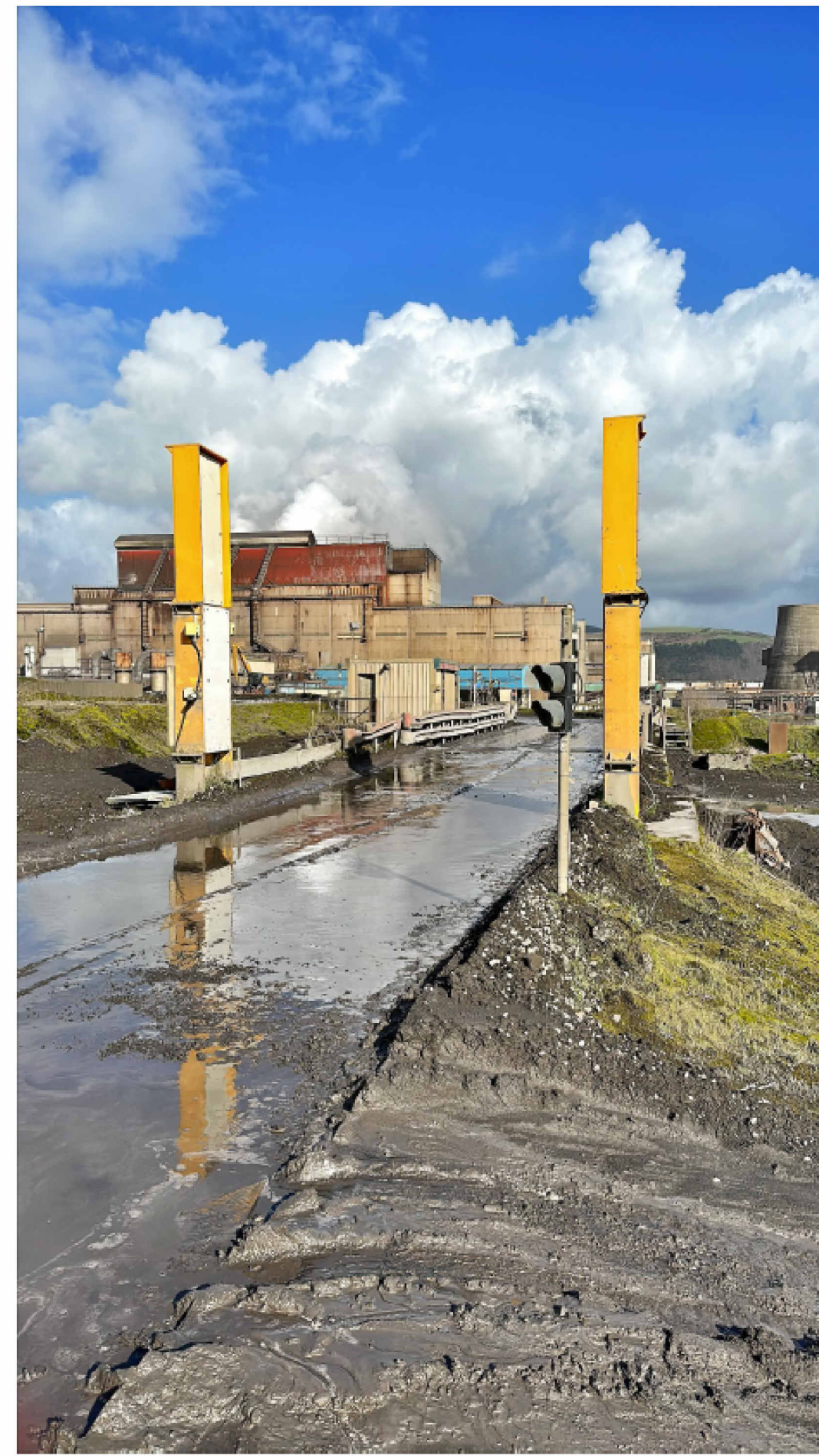
Photo 1 - Weigh Bridge