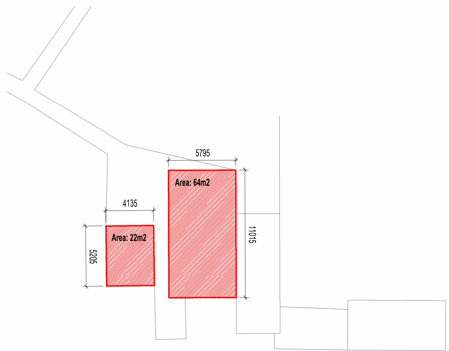
1 Demolition Plan - Harsco Baler Plant 1 : 200

Construction (Design and Management) Regulations Design risk assessments are carried out throughout the design stage of this project in accordance with company procedures and manuals. Where reasonably possible all areas of risk applicable to design and end use of the construction have been identified and then eliminated, mitigated or recorded as a residual risk. Note that general risks of which a competent designer or contractor should be aware are not included. This drawing is to be read in conjunction with the Pre-construction Information and all related documents prepared in accordance with the current Construction (Design and Management) Regulations 2015 and all applicable Health and Safety legislation as currently amended.