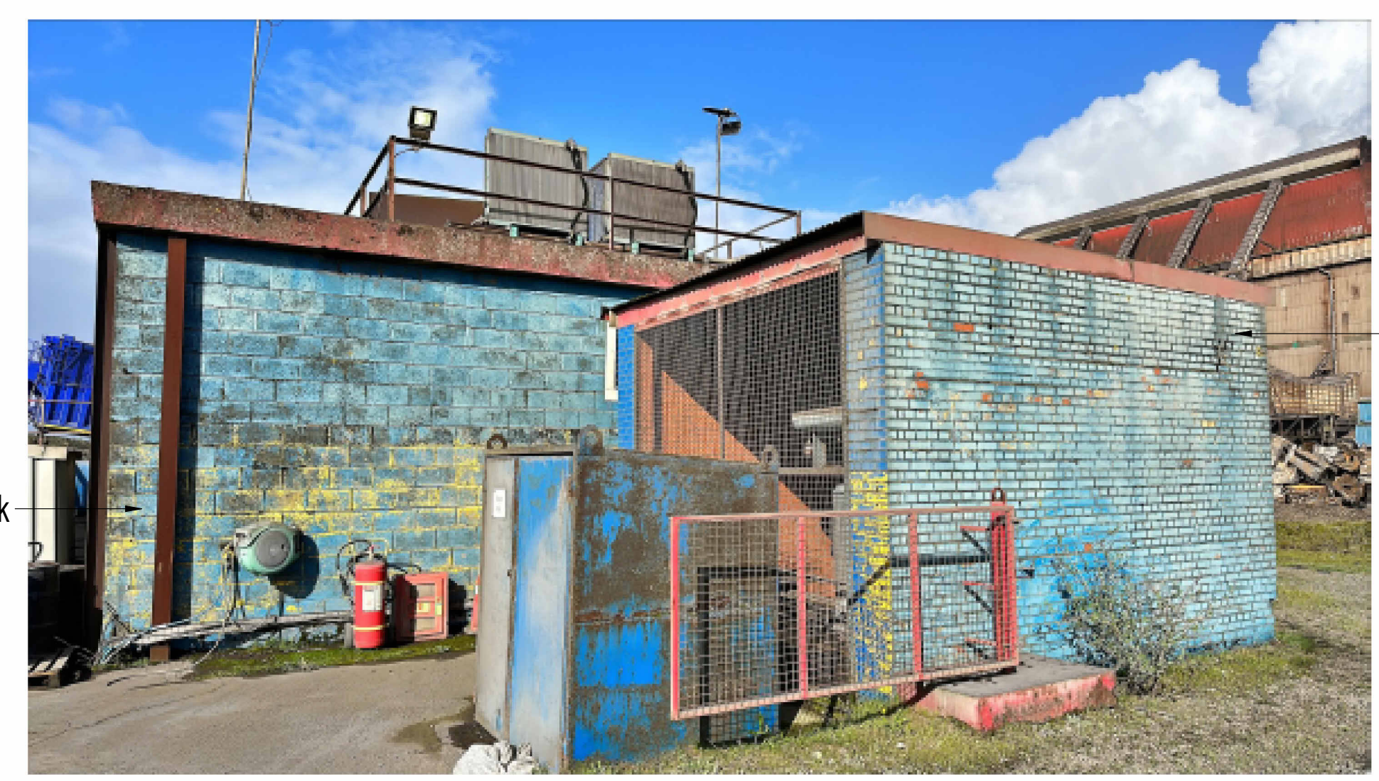
Photo 3 - Harsco Baler Plant