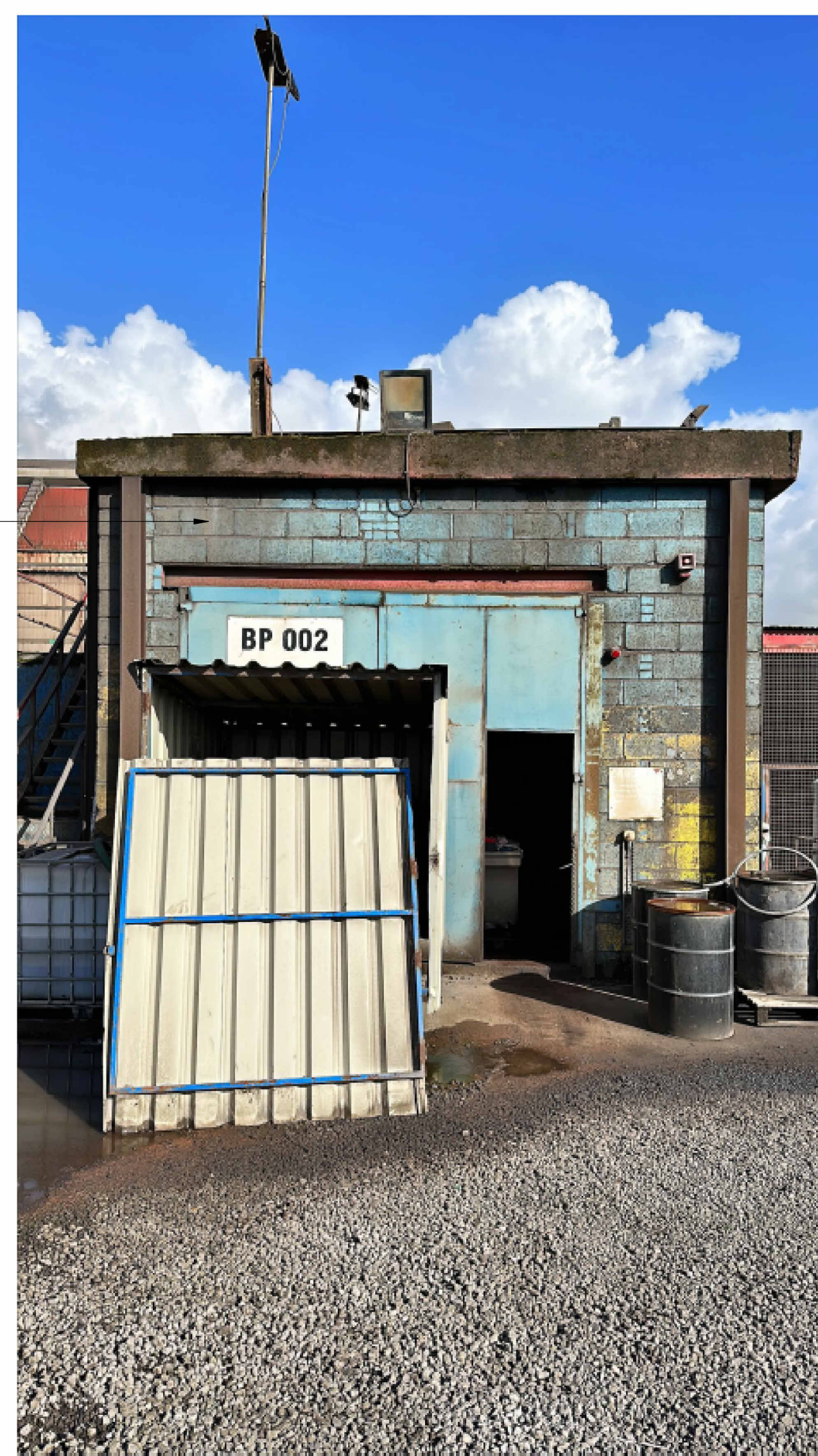
Photo 1 - Harsco Baler Plant