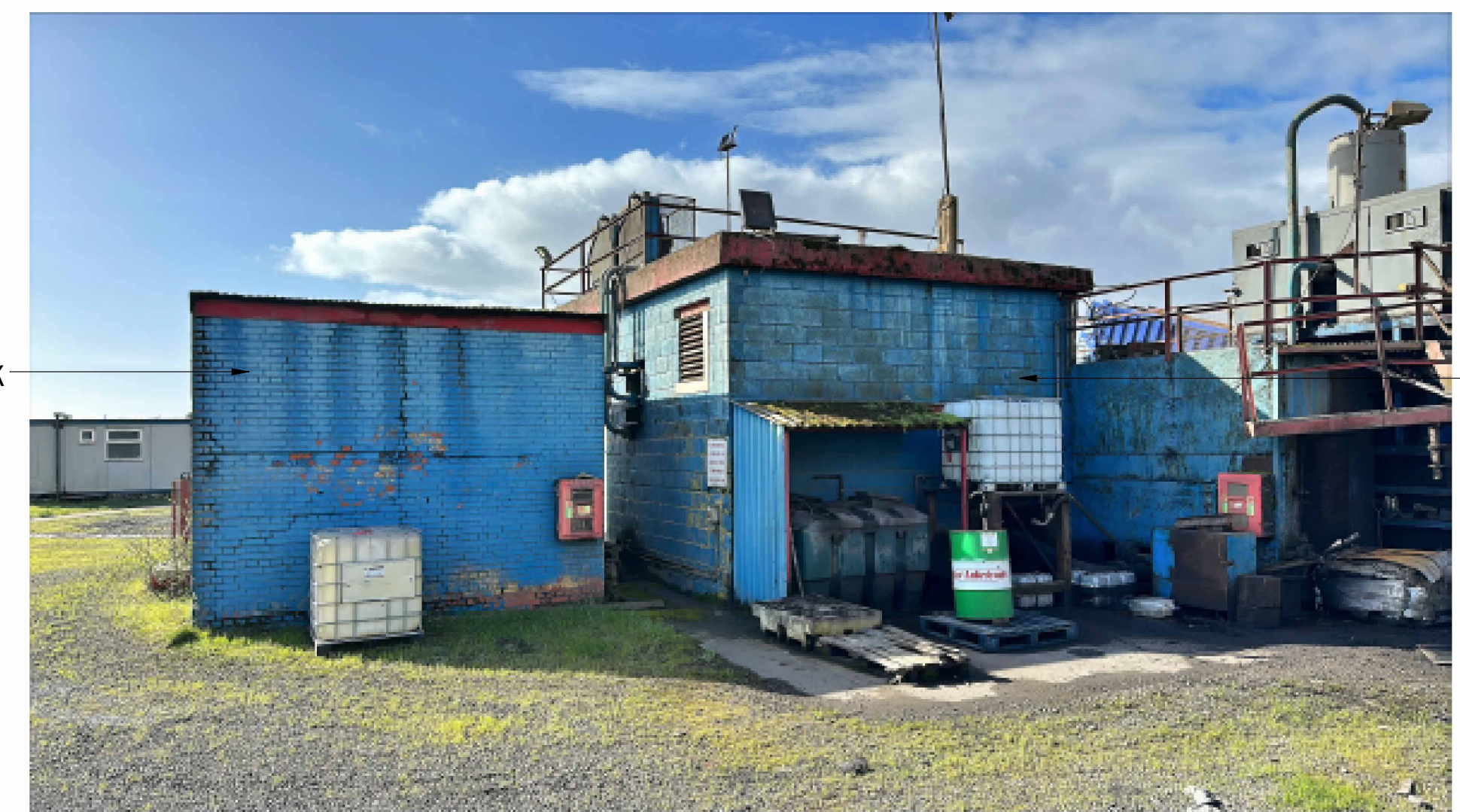
Photo 4 - Harsco Baler Plant