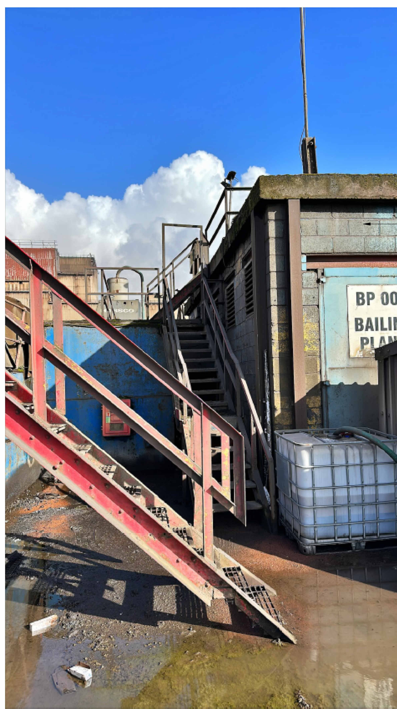
Photo 2 - Harsco Baler Plant