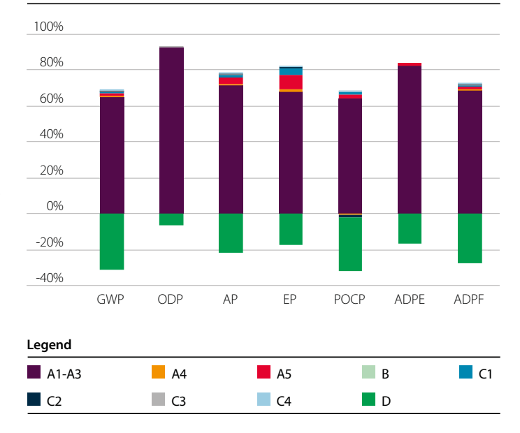
Figure 3 LCA results for the cladding system

Module D values are largely derived using worldsteel's value of scrap methodology which is based upon many steel plants worldwide, including both BF/BOF and EAF steel production routes. At end-of-life, the recovered steel cladding is modelled with a credit given as if it were re-melted in an Electric Arc Furnace and substituted by the same amount of steel produced in a Blast Furnace <sup>[24]</sup>. This contributes a significant reduction to most of the environmental impact category results, with the specific emissions that represent the burden in A1-A3, essentially the same as those responsible for the impact reductions in Module D.