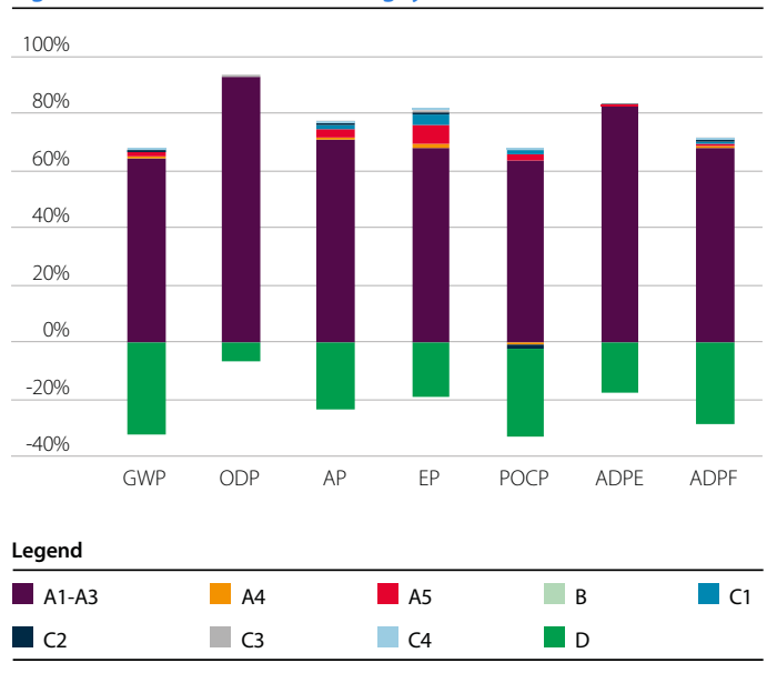
Figure 3 LCA results for the cladding system

Module D values are largely derived using worldsteel's value of scrap methodology which is based upon many steel plants worldwide, including both BF/BOF and EAF steel production routes. At end-of-life, the recovered steel cladding is modelled with a credit given as if it were re-melted in an Electric Arc Furnace and substituted by the same amount of steel produced in a Blast Furnace [24]. This contributes a significant reduction to most of the environmental impact category results, with the specific emissions that represent the burden in A1-A3, essentially the same as those responsible for the impact reductions in Module D.